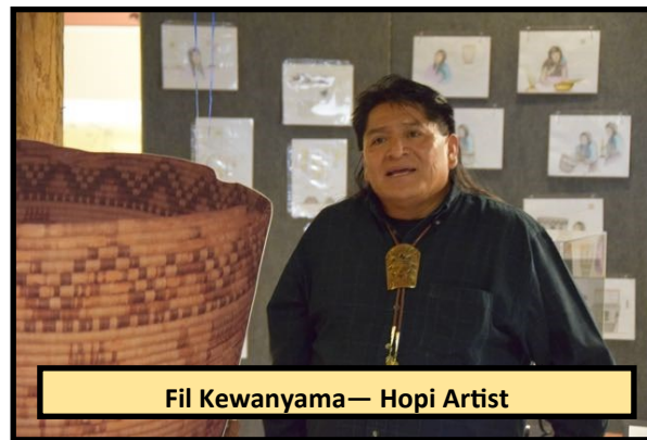
Fil Kewanyama— Hopi Artist

The hands-on learning portion of the tour ensures that students get a genuine feel for what prehistoric and historic life was like.