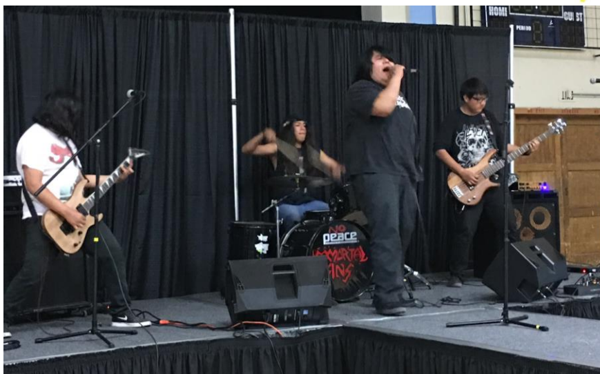
Immortal Sins! All under 17 years old