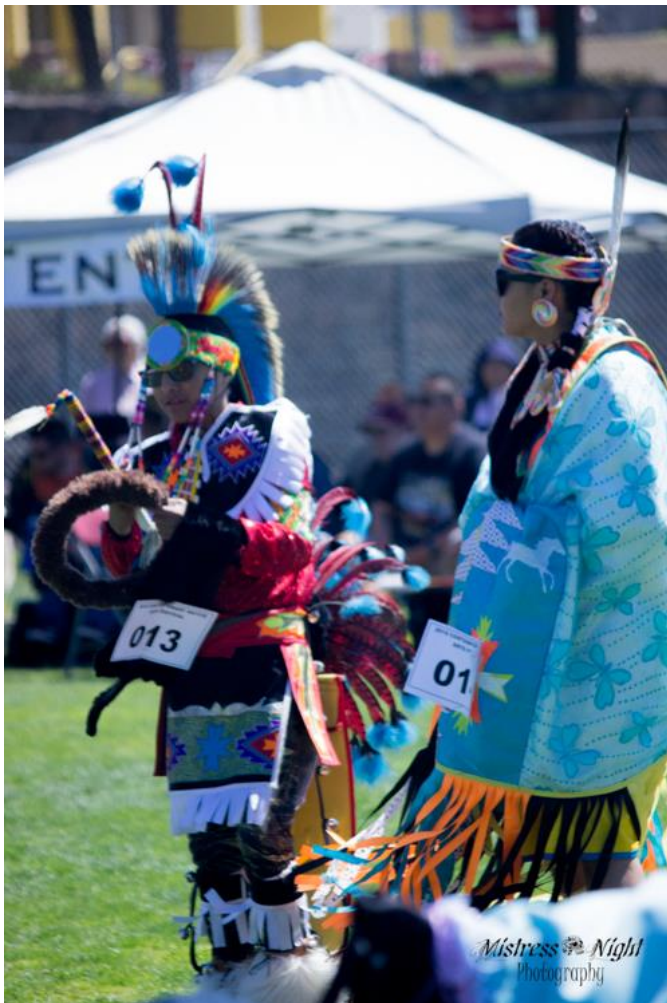
Competition Powwow Dancers